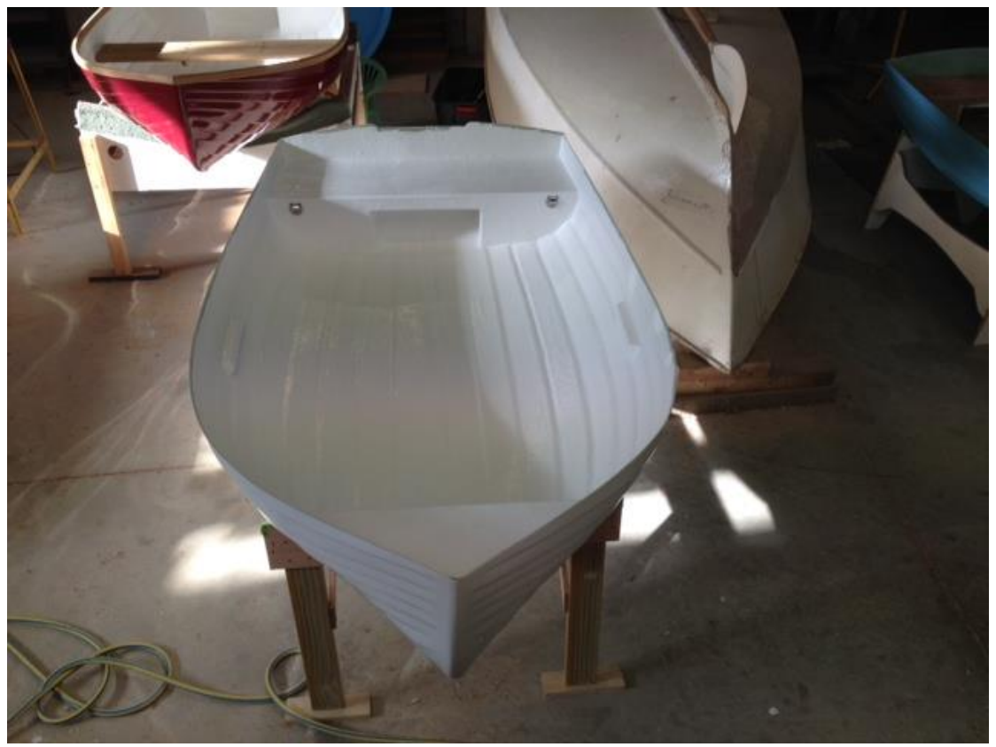
The interior is flocoted.