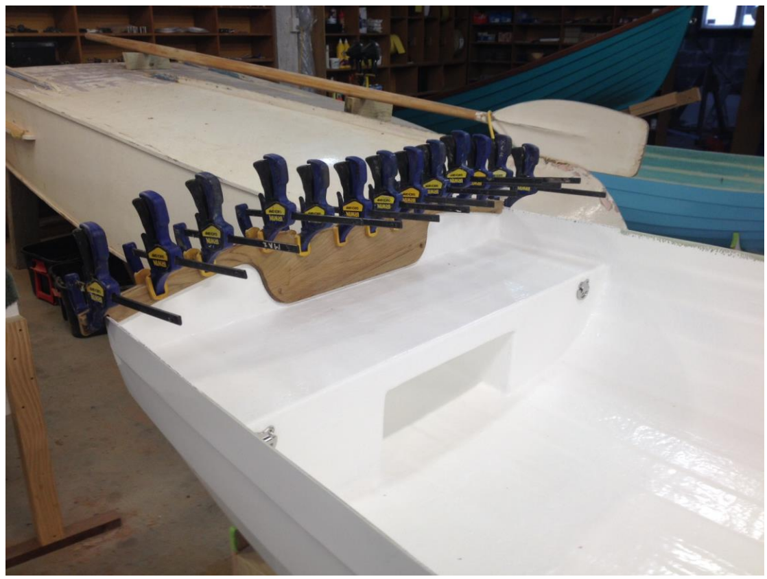
Teak transom plate.