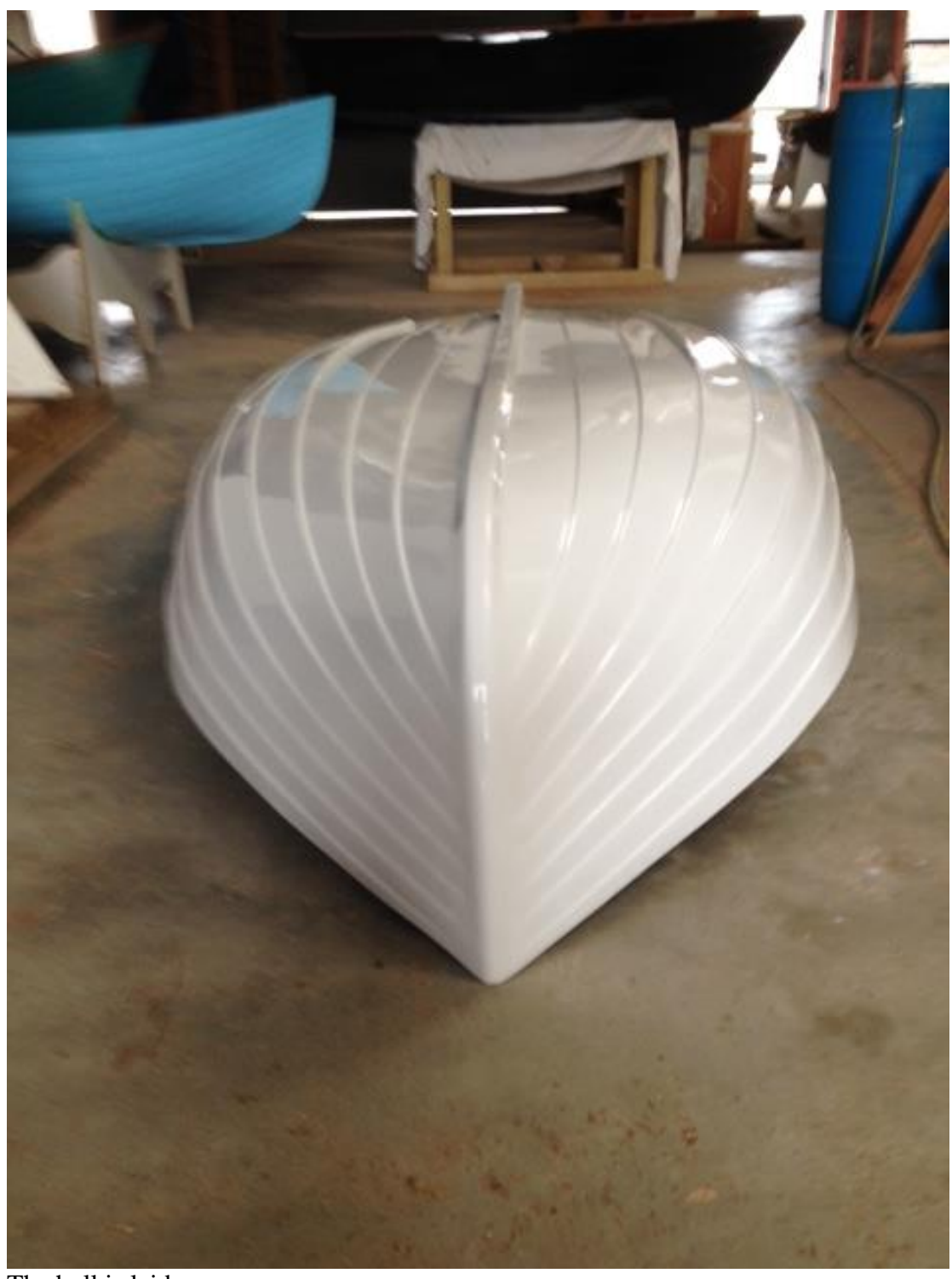
The hull is laid up.