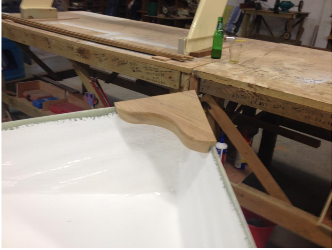
Installation of the teak woodwork begins.