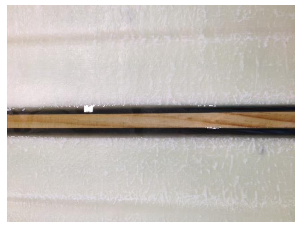
The keel is filled with timber and resin to prevent any leaks from wear and tear to the keel.