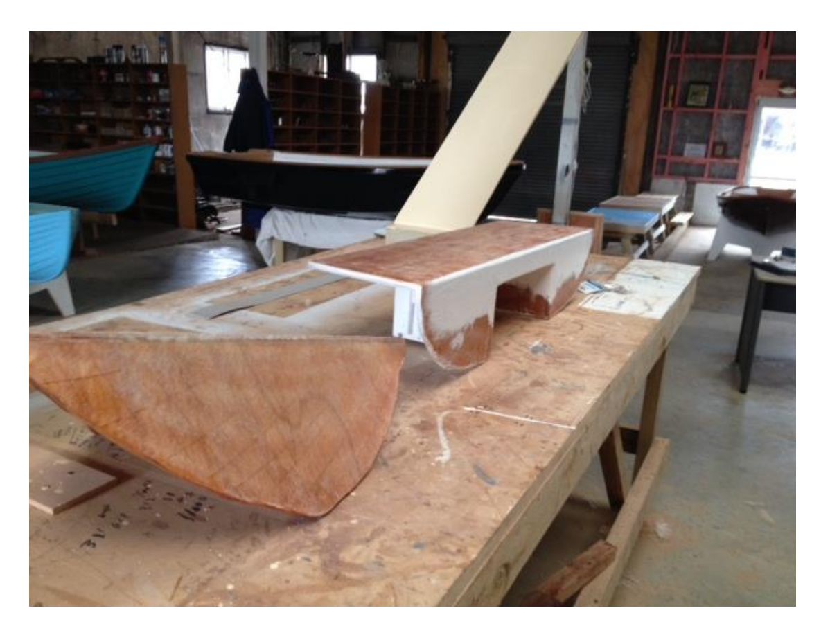
Tanks/seats are made with marine ply BS Standard 1088 and sheathed with fibreglass.