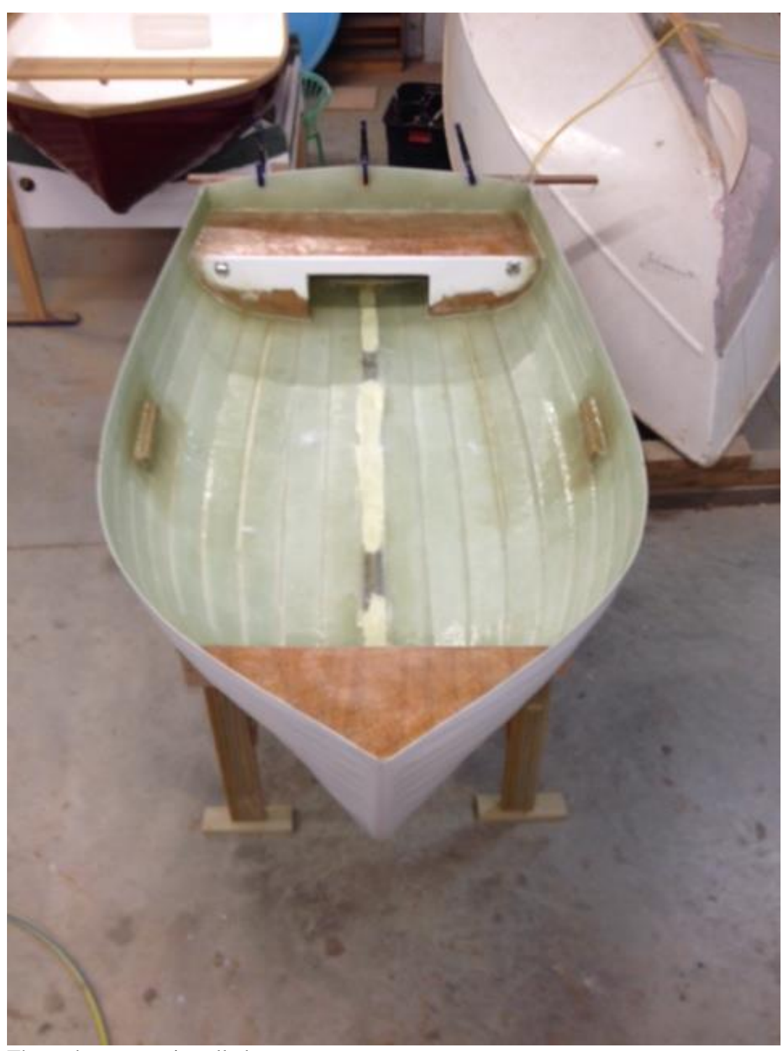
The tank seats are installed.