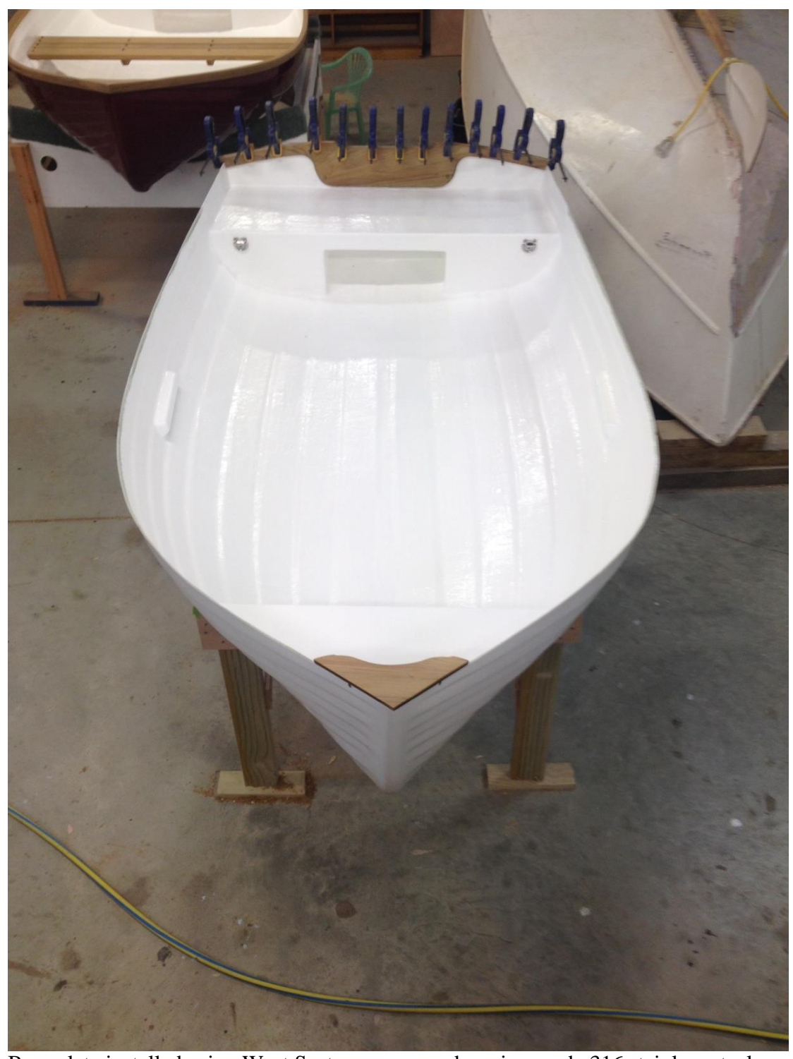
Bow plate installed using West System epoxy and marine grade 316 stainless steel fasteners.